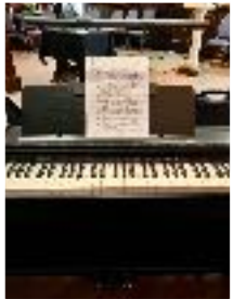
The new keyboard also briefly graced the Narthex for the Maundy Thursday service.