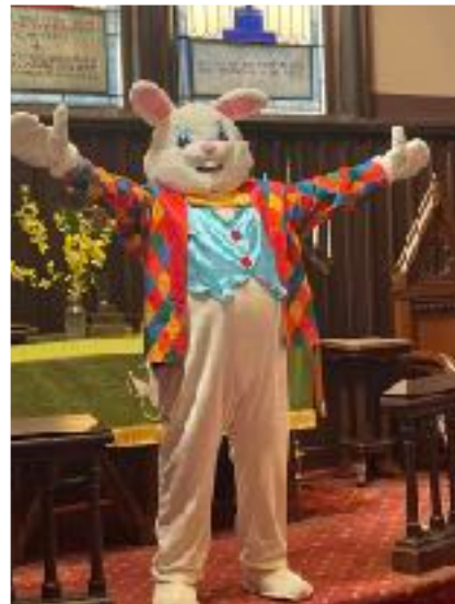
A great time really was had by all ❤️